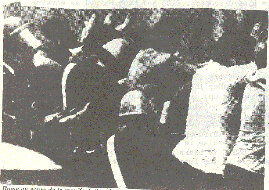
Rome au cours de la manifestation de soutien aux 11 arrêtés du Secours Rouge.