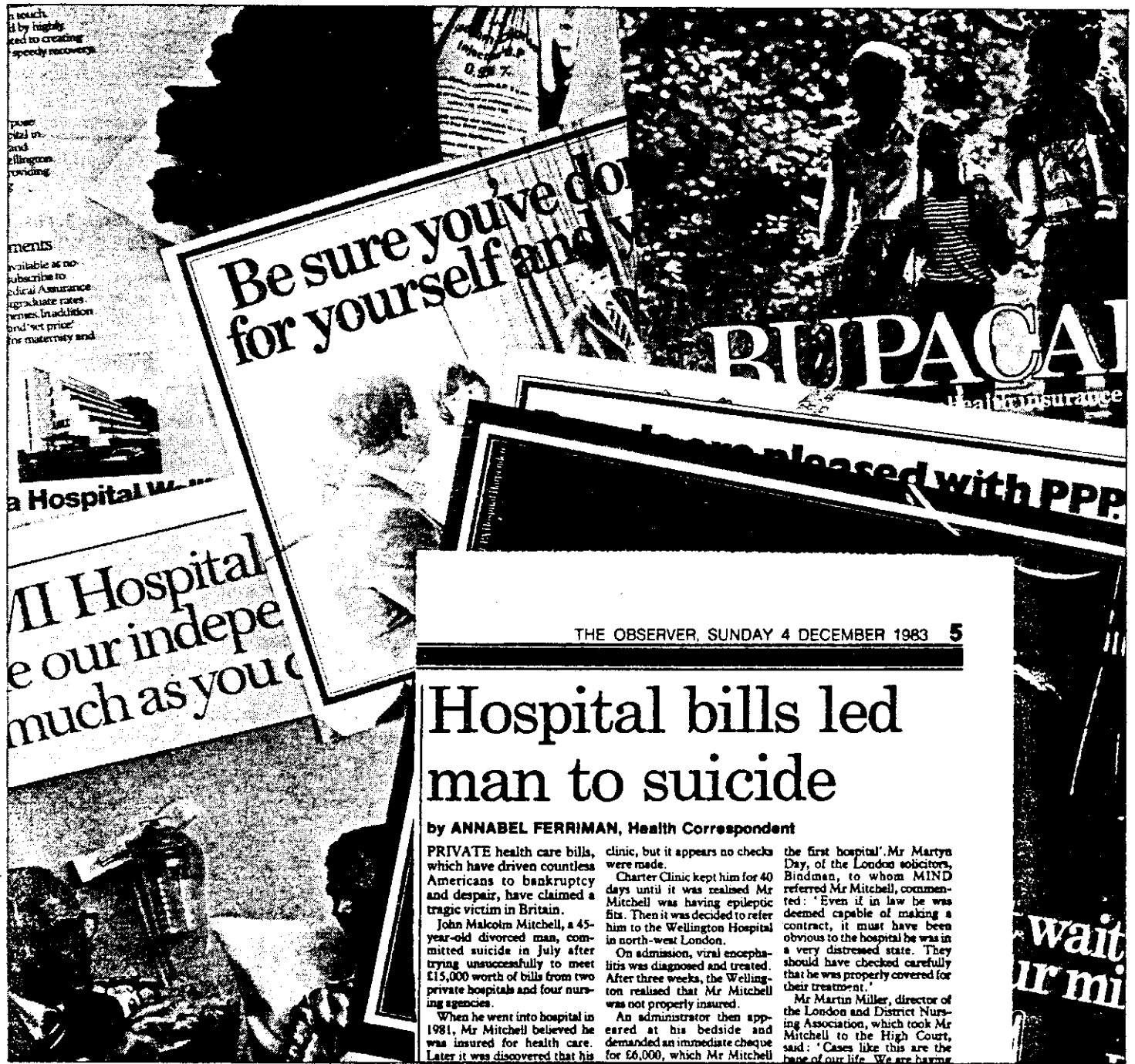
COVER OF A FOUR PAGE COLOUR LEAFLET

Kenneth Clarke, the Health Minister, says he cannot see the point in going private.